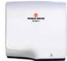
Cast Iron , White Porcelain enamel