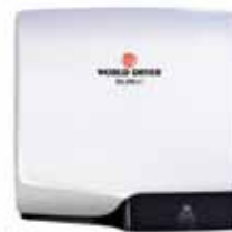
Aluminum , White