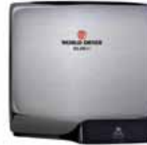
Aluminum , Brushed Chrome