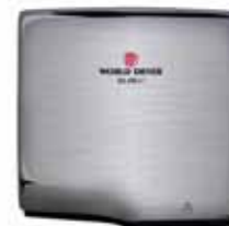
Stainless Steel , Brushed