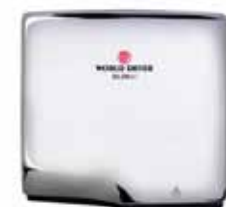
Stainless Steel , Polished