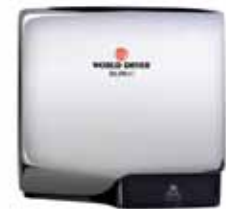
Aluminum , Polished Chrome