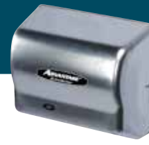
Steel Satin Chrome