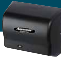
Steel Black Graphite