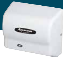
Steel White Epoxy